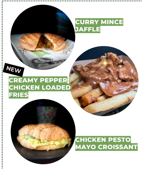
CURRY MINCE JAFFLE